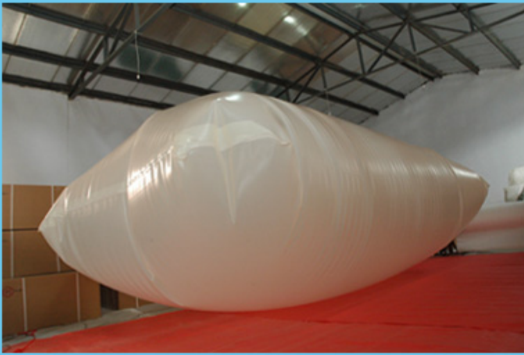
1 layer PE with thickness of 1mm