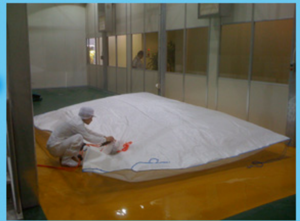
2 layers PE(0.3mm per layer)

Single use for foodstuff, non-hazardous pharmaceutical, chemical and industrial liquid.